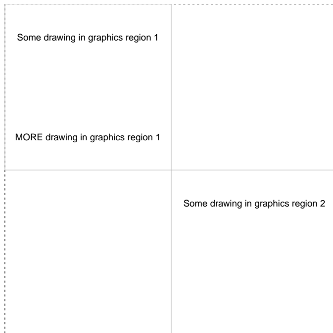
Figure 2: Defining and drawing in multiple graphics regions.