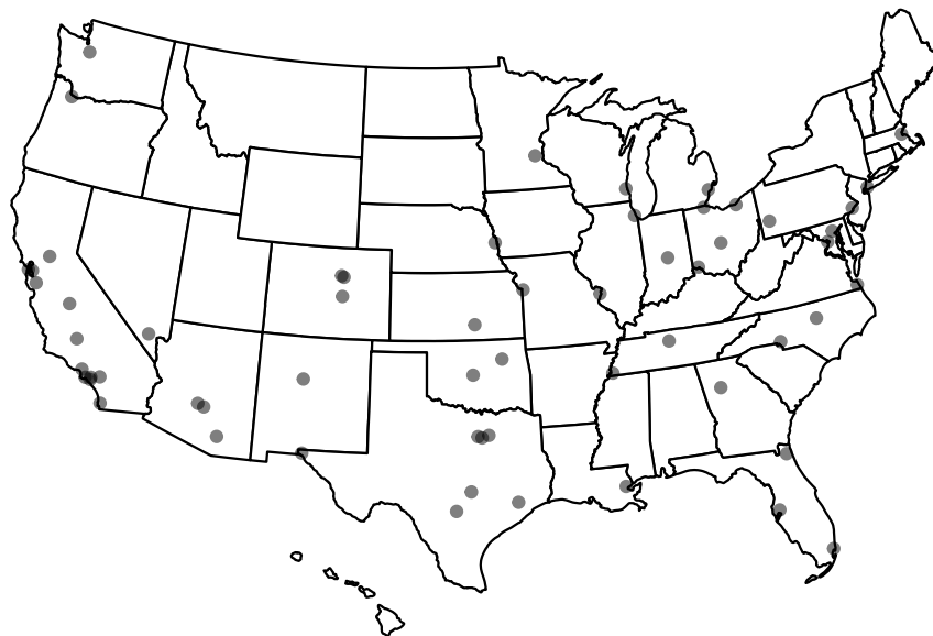
60 Populated Cities in the US

In order to find the mean location of those cities, the first option would be to come up with an Euclidean way of thinking: do the averaging for longitude and latitude of all corresponding cities. However, a more geometrically sound way of doing it would be to find geodesic mean. Here, we will use riem.mean() function that computes Fréchet mean on the manifold. As we described above, the steps will be shown in the code snippet below. For the convenience, we also added the location information in cartesian coordinates as well.