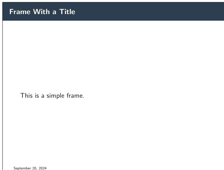
Figure 1: A simple example.

For best results, we recommend installing the fonts Fira Sans and Fira Mono and compiling with Gotham using XeLaTeX or LuaTeX. These are optional dependencies; Gotham is compatible with (e.g.) pdfL A T E X and will fall back to standard fonts if Fira Sans or Fira Mono is not installed.